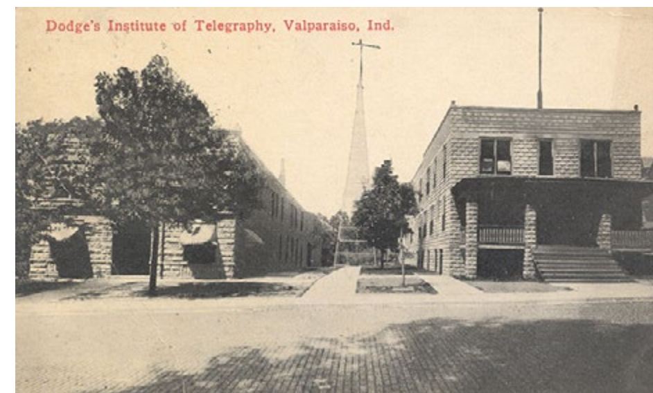
Dodge Institute of Telegraphy ca. 1910

All day today a gang of men tussled with the big plate glass that is being set into the show windows. Little by little they are being placed, and in a few days the big establishment will present a finished appearance from the outside.