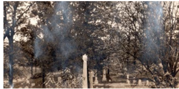
Old City Cemetery ca. 1914