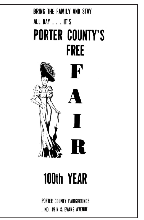
Image • Detail from the full-page advertisement for the 1972 Porter County Free Fair.

Starting in August, the PoCo Muse will offer a free kid-friendly scavenger hunt activity. Visitors will have to look closely at some of the displayed artwork to find the clues hidden throughout the exhibit. Answer all the questions and unlock a secret message to claim your prize! Stop by the PoCo Muse anytime during our open hours (Tues-Sun, 11a-4p, and until 7p on Thurs) to pick up a packet and get started.