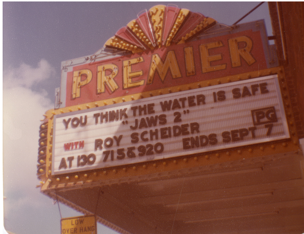
Left • Photograph of the Premier Theatre Marquee. 1978.

One of the most recognizable features of the Premier Theatre was its marquee. This photograph from the 1978 captures the marquee advertising the film from that summer, Jaws 2 . Notice the paraphrase of the famous and oft-parodied tagline, "Just when you thought it was safe to go back in the water."