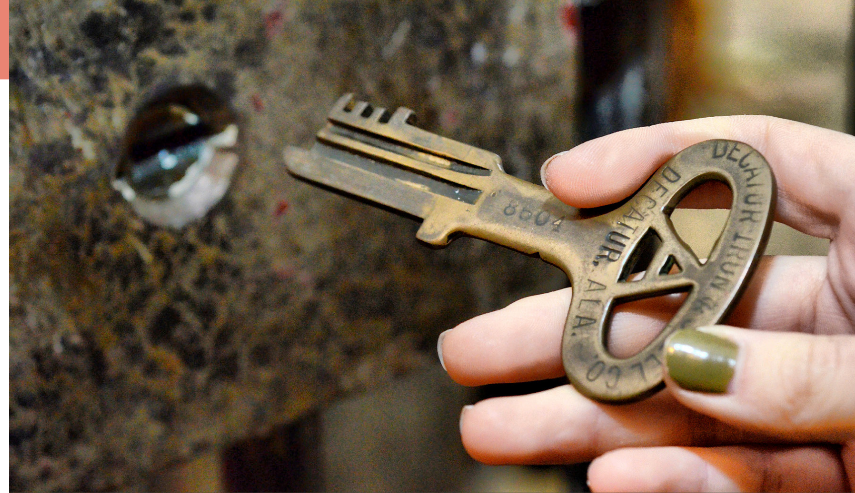
Image • A photograph of the still-functional jail keys from 1949 of the former Porter County Jail. 2020.

MEMBERS' PREVIEW Thursday, September 23, 4-7p