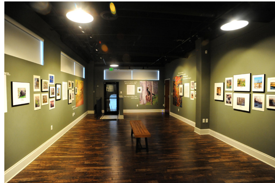
Above • An installation view of The Path That Ventures Within: Inspirations Found Along Indiana Dunes Trails, on view through May 12 in the Montague/Urschel Gallery.