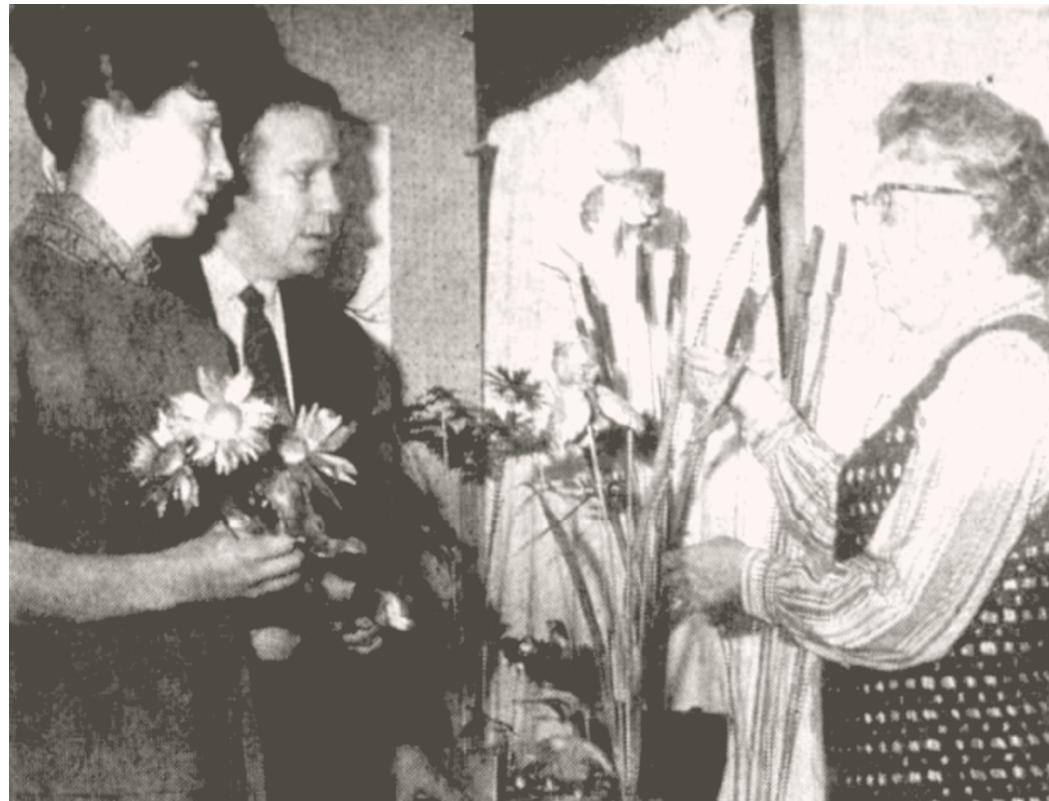
Left • The Vidette-Messenger , March 27, 1971.